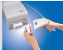
> Standalone mode with scanner