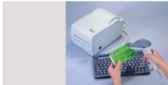
> Standalone mode with Argokee

*Maximum Default Delay Time to Sleep (minutes): 5